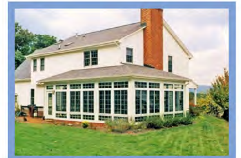
Converted Screen Room/Porch