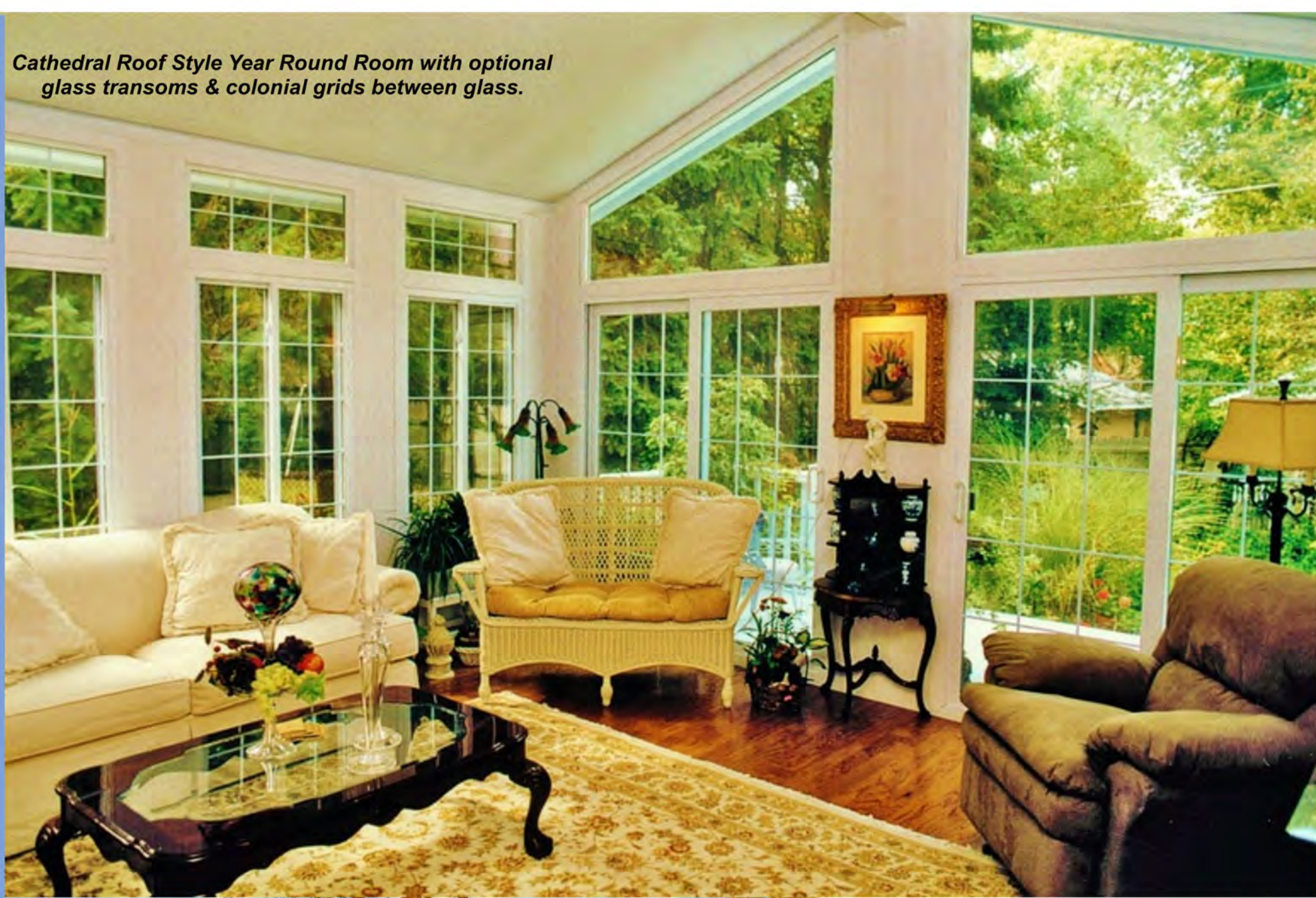
Cathedral Roof Style Year Round Room with optional glass transoms & colonial grids between glass.

The American Dreamspace Sunroom will open a new world of opportunities for you, your family and friends. Now you can affordably and effortlessly expand your living space, while adding beauty, comfort, functionality and value to your home. Basking in the great outdoors without the worries of unpredictable weather will no longer be just a daydream with a Dreamroom by American Dreamspace.