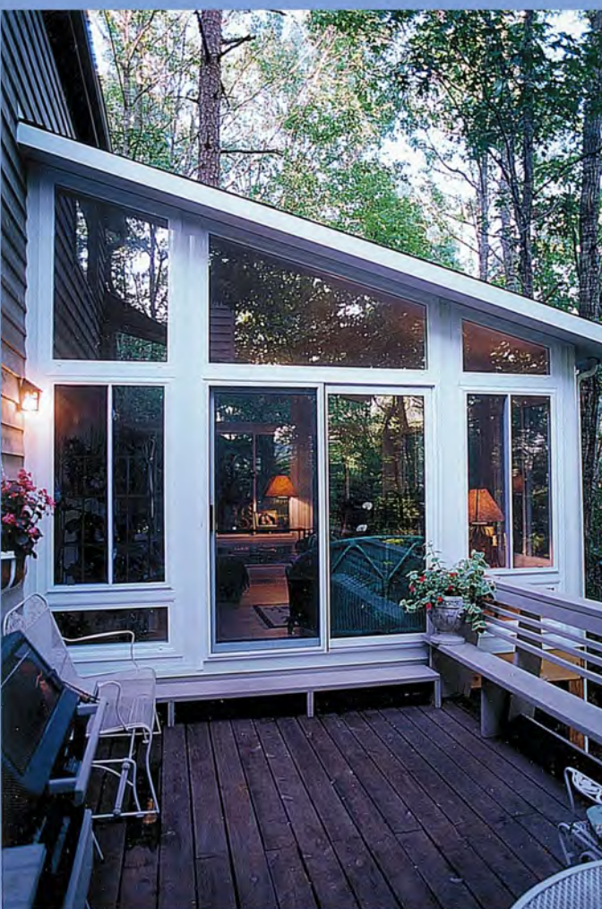
Marquee Roof Style