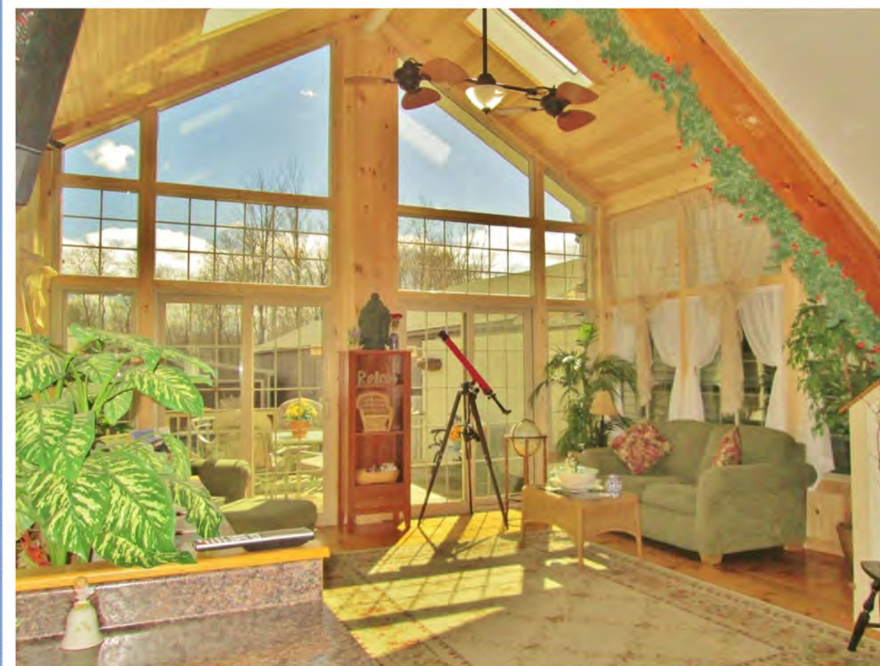
4- Season Year Round Cathedral Dreamroom 6400 Series® with optional knotty pine Tung & Groove ceiling & standard T&G pine wall trim.

Rated A+ by the Better Business Bureau with over 10 years accreditation & with NO COMPLAINTS ever!